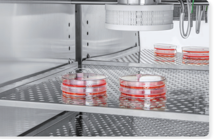
Stainless steel liner & water pond